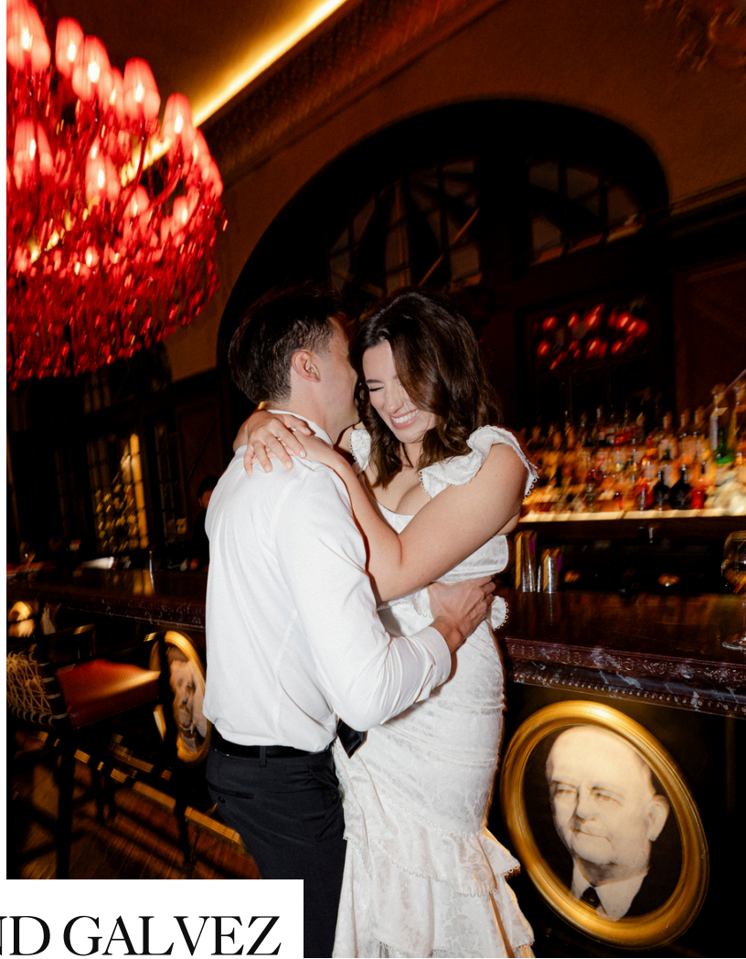
THE GRAND GALVEZ 2024 Seawall BLVD, Galveston, TX 77550 $275 permit